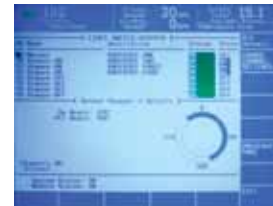
KNOCKOUT TIMING SCREEN